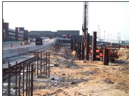
Photo shows the entrance to BWI Airport and the expansion for additional gates.