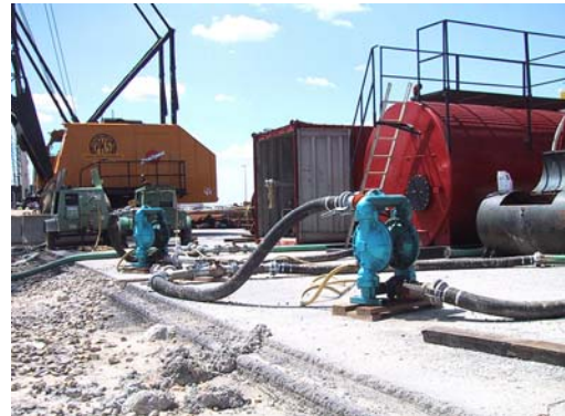
View of the slurry tank, diaphragm pumps, hoses, valves and air compressor required to run a Foundation slurry drilling project.

First the slurry equipment is set up on-site. Atlantic Caisson owns two 10,000 gallon slurry tanks, skid-mounted and fitted with platforms, which reduces tank rental costs. Hoses and pumps have been fitted with valves allowing slurry to be pumped from the tank holding fresh slurry into the caisson under construction. As concrete is poured into the drilled caisson, the slurry being displaced is recycled back into the second slurry tank for reuse on the next hole. Air compressors run the Sand Piper diaphragm pumps used to pump the slurry. Diaphragm pumps are preferred over centrifugal pumps, which can shear the polymer, break its molecular chains, and reduce its viscosity.