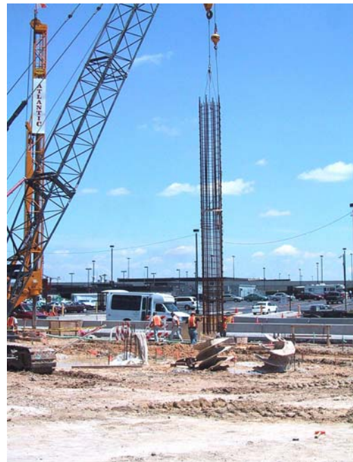
The crane lifts the rebar cage lowering it into the finished drilled shaft