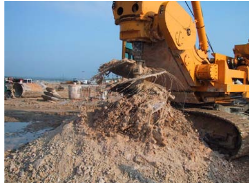
View of spoils spinning from auger. The polymer can be seen flying off the auger. Notice how dry the spoils stay.